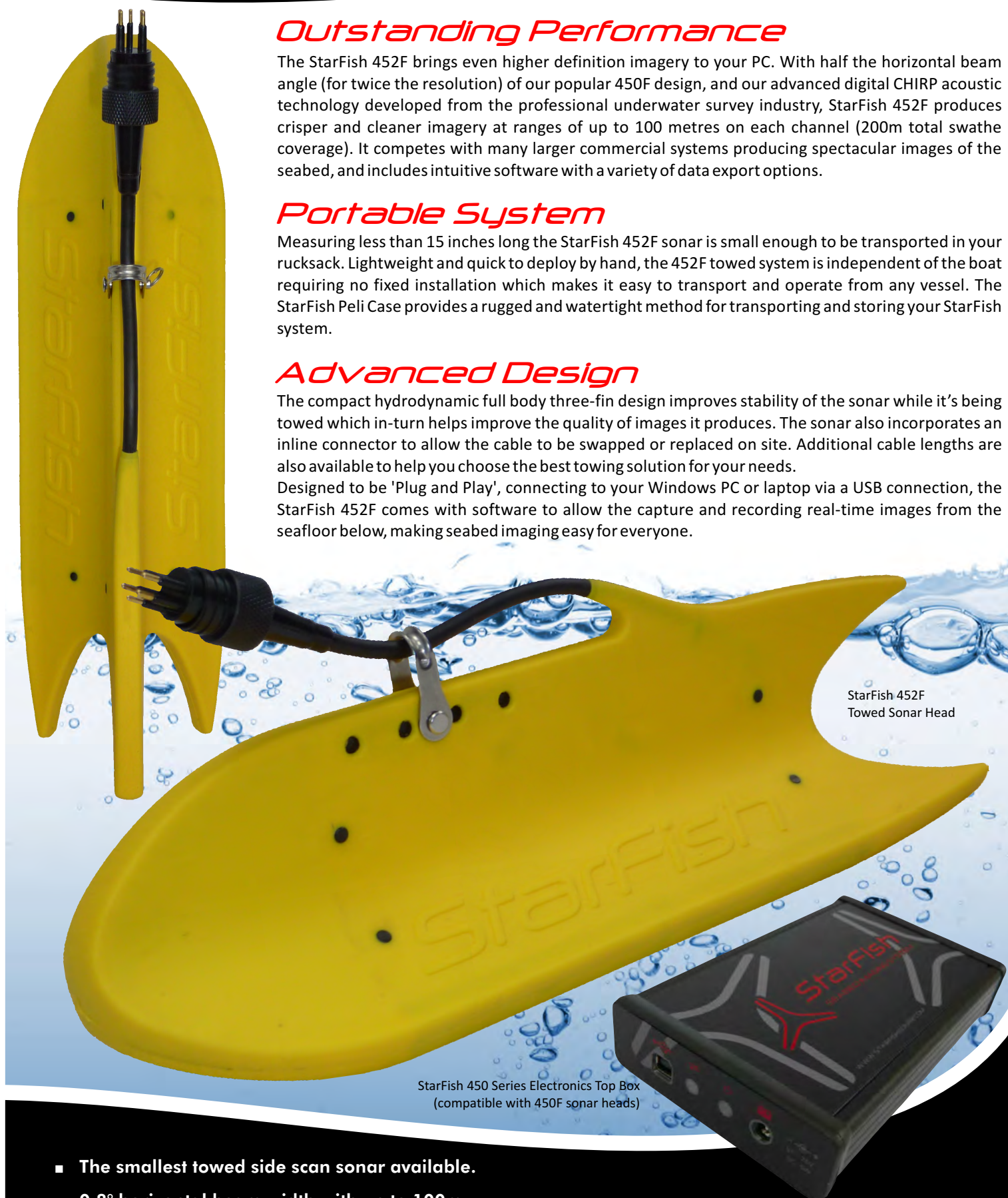
StarFish 452F Towed Sonar Head

Designed to be 'Plug and Play', connecting to your Windows PC or laptop via a USB connection, the StarFish 452F comes with software to allow the capture and recording real-time images from the seafloor below, making seabed imaging easy for everyone.