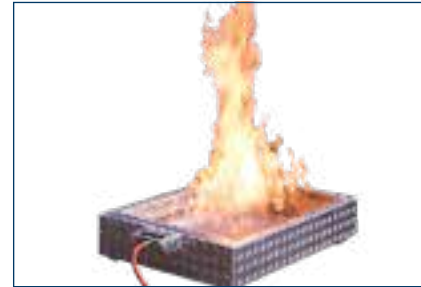
The Hybrid without water