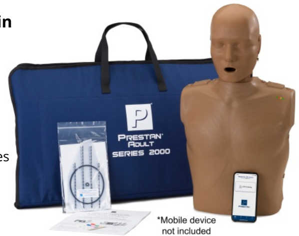
*Mobile device not included

The Professional Adult Series 2000 Lung Bags use the same easy to install PRESTAN design with the addition of a breath sensor. The Series 2000 lung bags are required for ventilation feedback via the PRESTAN CPR Feedback app.