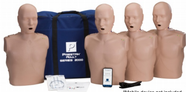
*Mobile device not included