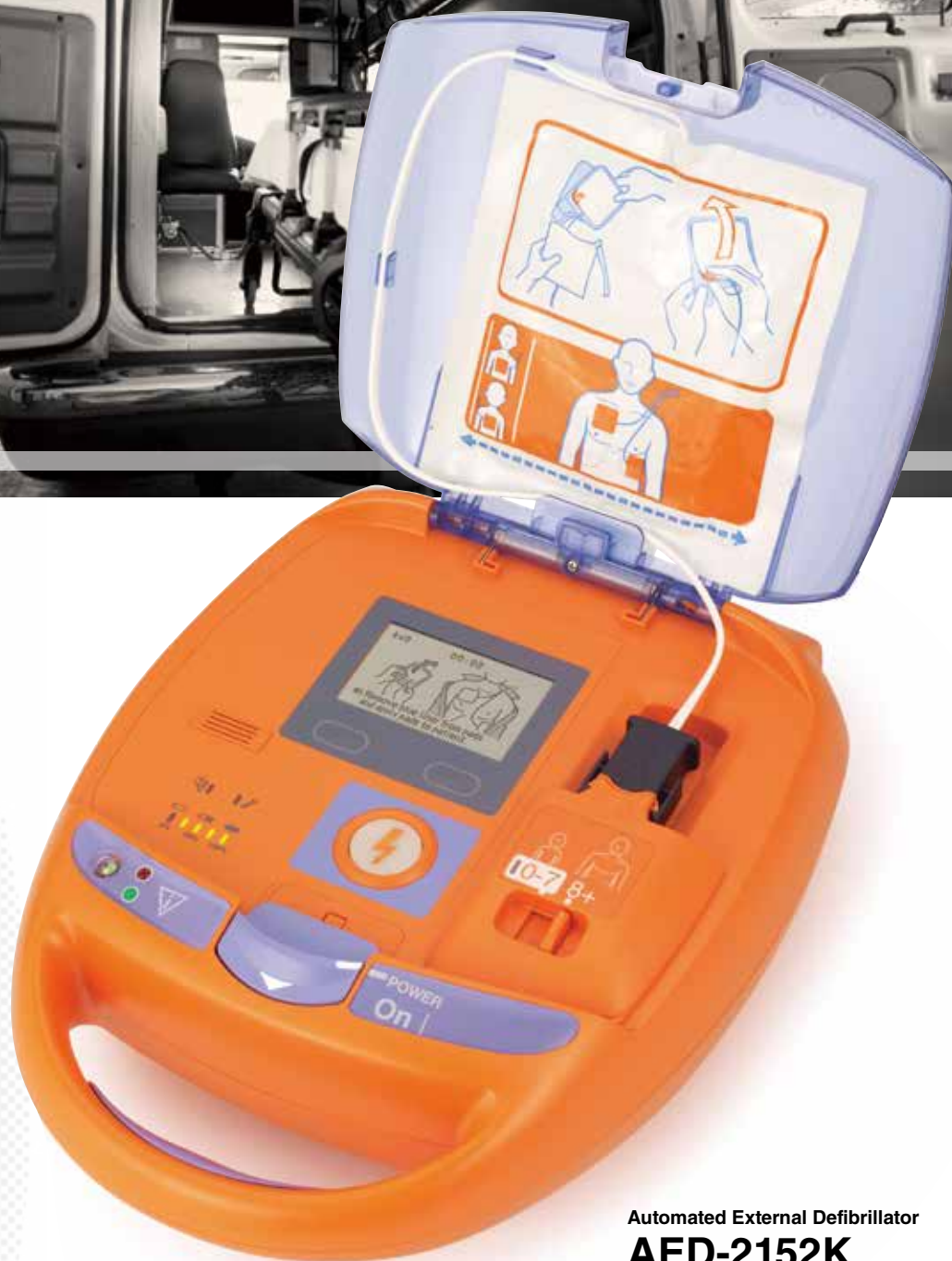
Automated External Defibrillator AED-2152K