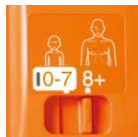
AED-2152K can be used for child by only changing mode switch.